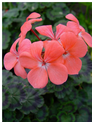
Pelargonium "Salmon Black Vesuvius"