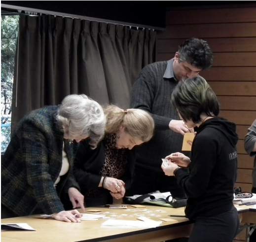
Selecting seeds we want.

Canadian Geranium & Pelargonium Society Annual Plant Sale Saturday, May 7, 2011 10 am to 4 pm In the Floral Hall, VanDusen Garden,