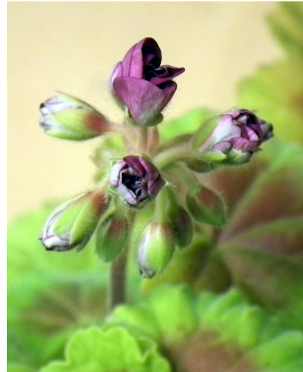
Ian's new stellar in bud.