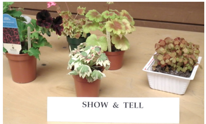
Plants on the Show & Tell table.